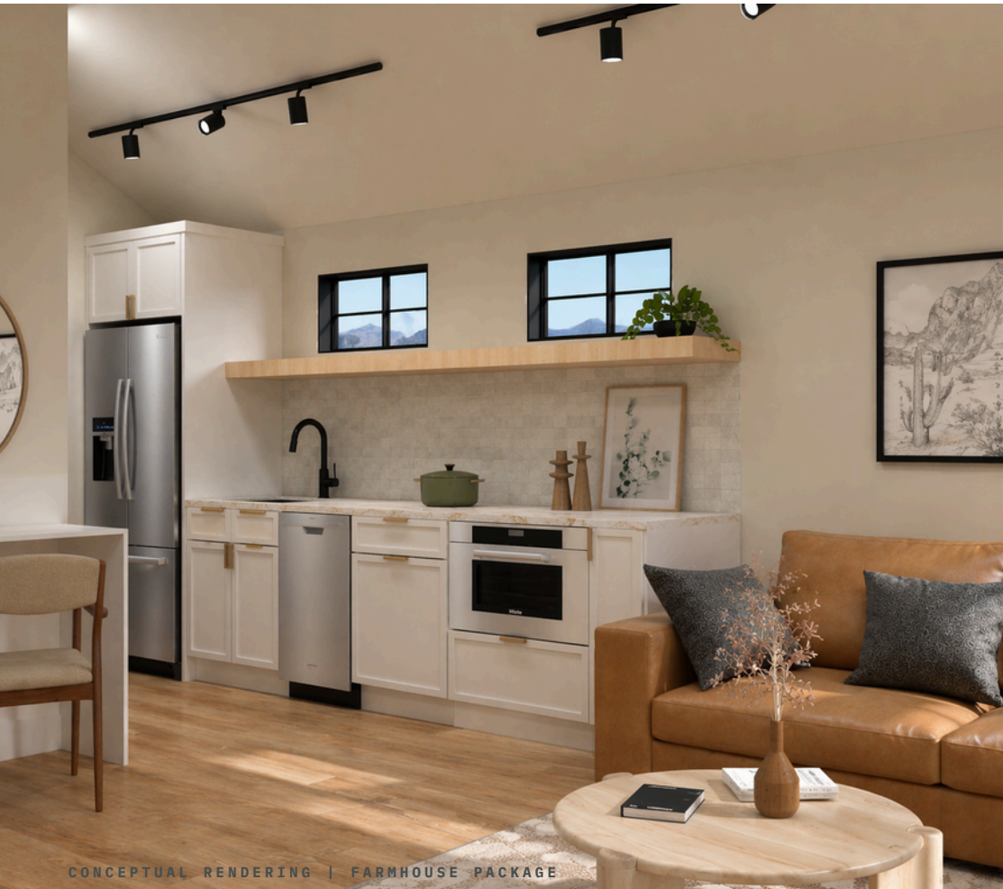
CONCEPTUAL RENDERING | FARMHOUSE PACKAGE