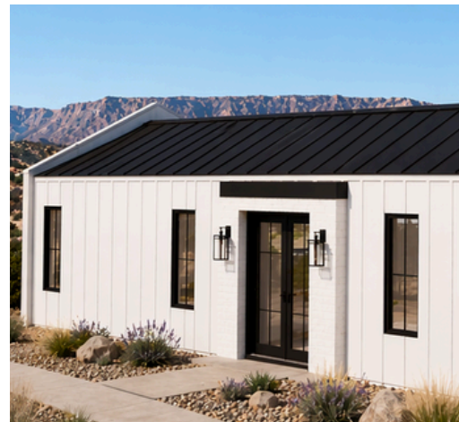
CONCEPTUAL RENDERINGS | FARMHOUSE PACKAGE | INTERIOR ADD-ONS SHOWN