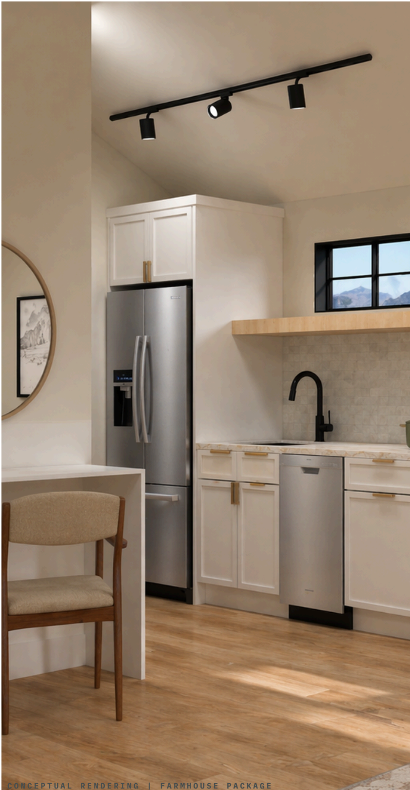
CONCEPTUAL RENDERING | FARMHOUSE PACKAGE