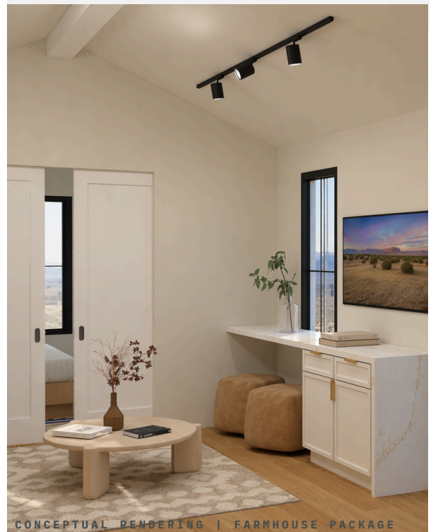
CONCEPTUAL RENDERING | FARMHOUSE PACKAGE

Open, bright, and designed for how you actually live. The layout eliminates wasted space—room for living, dining, and everything in between, with sightlines that keep the whole home connected without feeling cramped.